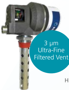
Hi-speed Dry Break Refuelling

BANLAW'S PATENTED AUTO ID HARDWARE PROVIDES A FULLY INTEGRATED SOLUTION, MORE ACCURATE AND SECURE THAN ANY OTHER